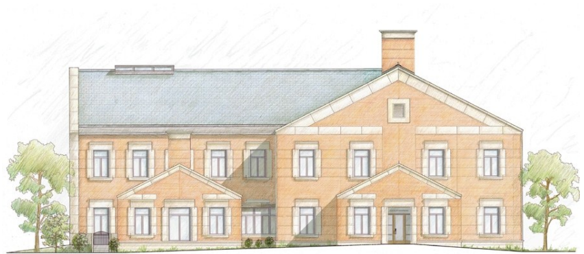
Artist Rendering of Doris Kelley Christopher Hall