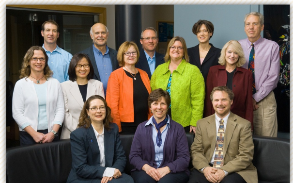
I-TOPP Principal Investigators

I-TOPP is a five-year, $4.5 million program supported by the Agriculture and Food Research Initiative of the USDA National Institute of Food and Agriculture. I-TOPP Scholars will receive a generous stipend, tuition-assistance, research and travel funds. The first group of Scholars will start in the of Fall 2011.